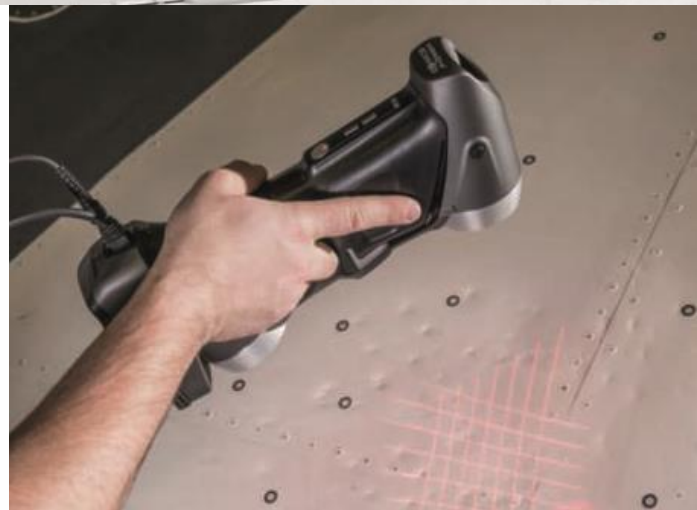
Portable Manual Scanner for small size samples acquisition

We have also two volume acquiring tracker that can be mounted opposite each other in our control room, to digitalise every kind of sample irrespective to surface and shape and with no previous preparation or treatment needed.