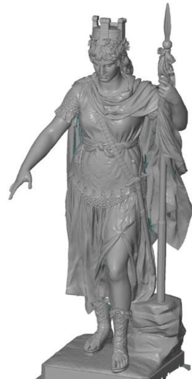
Statue of Liberty – San Marino