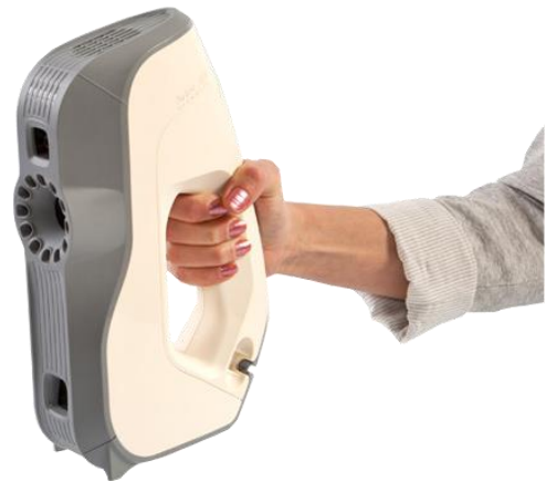
Quick Acquisitions of Details and Colors