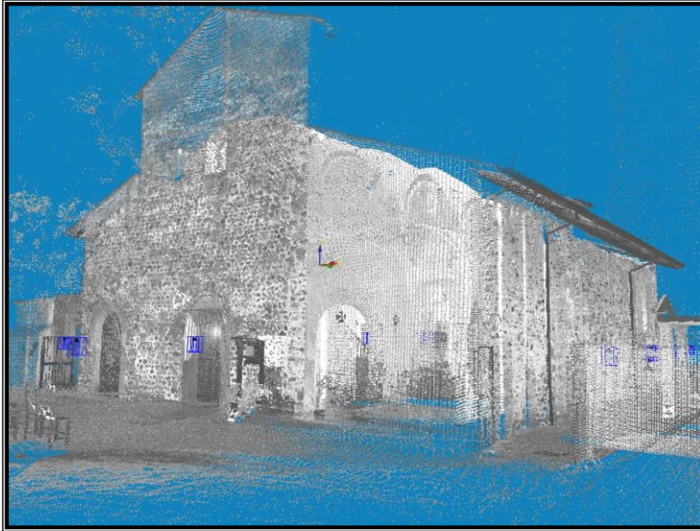
3D Scanning Abbey Church