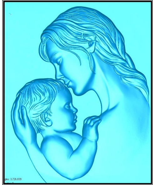
Scan of a bas-relief