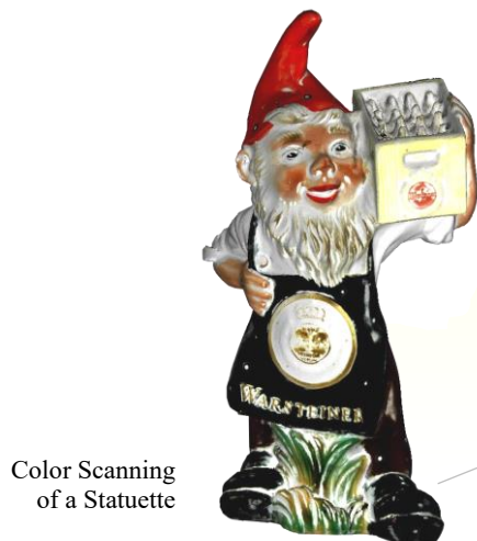
Color Scanning of a Statuette